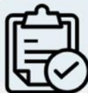
Compliance and MOC